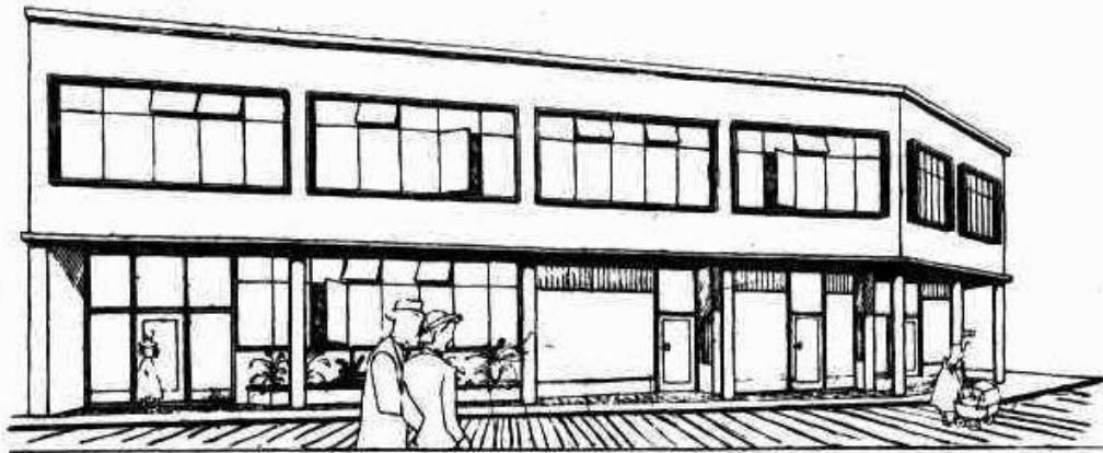
This two-storey building to be erected by Mr. N. L. Payton on the corner of Spencer and Stirling streets is expected to cost in the vicinity of £22,000.

Colin Mort's sketch view of proposed offices and shops at the corner of Spencer and Stirling Streets Bunbury ( South Western Times , 21 August 1952, p.8).