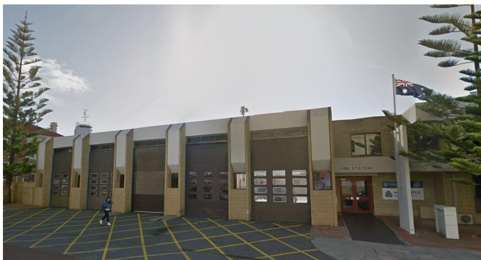
Fire Station at Phillimore Street Fremantle of 1976.