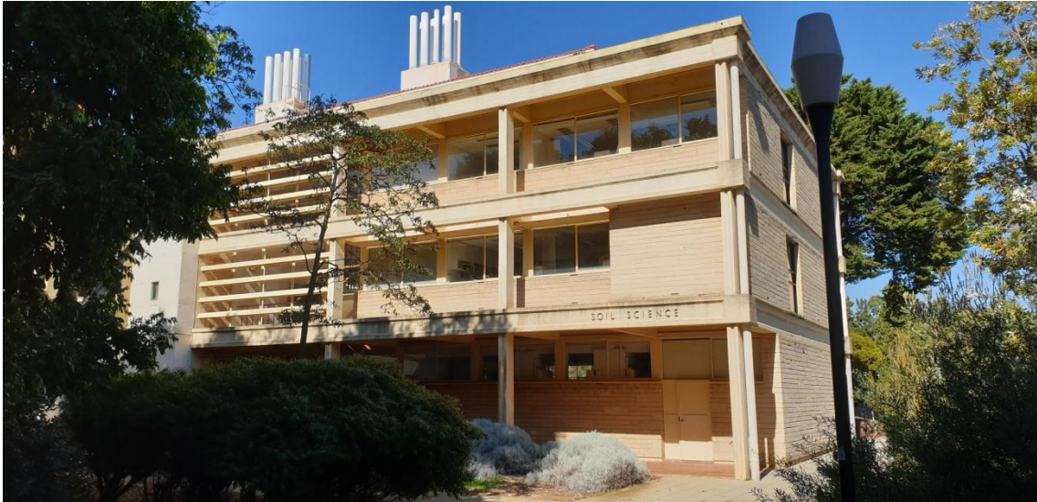
Soil Science Building of 1968 at University of Western Australia, Crawley.