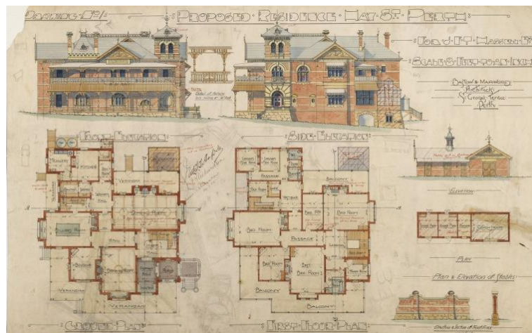
Floor plans and elevations of 1904 Hassell residence Kendenup in Hay Street, West Perth (slwa_b1910704).