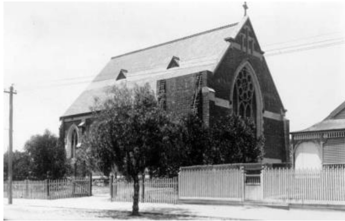
1906 St Andrew's Church at 257 Barker Road Subiaco c.1915 (SLWA 001177D)

At a later time (1921), Bastow listed his major works in WA as the Miners' Institute at Kalgoorlie (1902) [although this building may in fact have been designed by Harvey Draper], markets at Perth (1904), Mosey's Chambers in Barrack Street, Perth (1904), and St Andrew's Church of England in Barker Road, Subiaco (1906). In 1905 the new Perth Markets were in the course of erection. The new general produce wholesale and retail markets built on four acres of land at Charles, Duke and John Streets in Perth were to be ready early in December 1905, valued at around £4,000, but the whole plan was for an outlay of about £20,000.