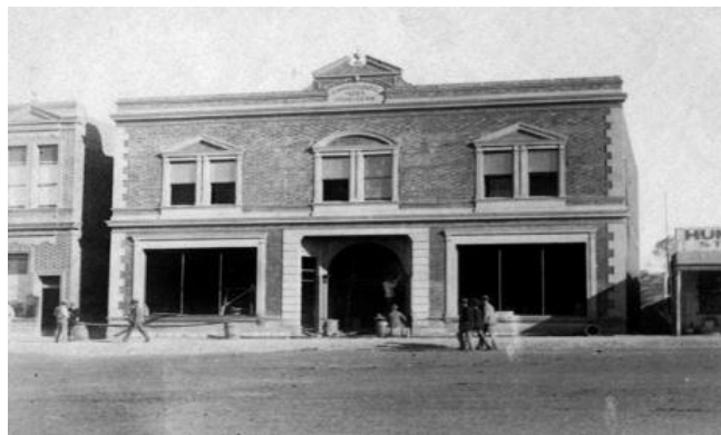
Coolgardie Chambers, Bayley Street Coolgardie under construction in 1895