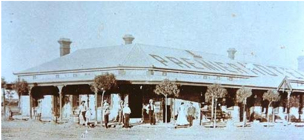
Premier Hotel at Kunanalling of 1901 ( www.outbackfamilyhistory.com.au )