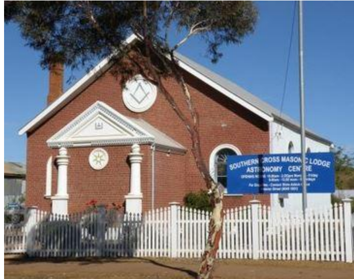
Southern Cross Masonic Hall of 1898 ( http://www.southerncross.crc.net.au/gallery/masonic- lodge/view )