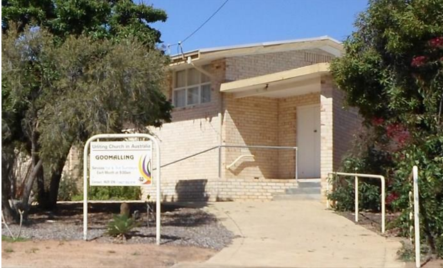
1959 Goomalling Methodist Church