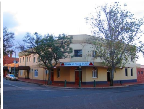
Duke of York Hotel, 61 Federal Street, Narrogin (Battye, J.S., Cyclopedia of Western Australia , Vol.2, 1913, p.712; Google 2011)