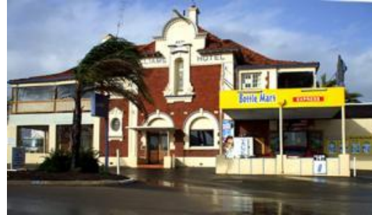
Williams Hotel, Albany Highway, Williams (Battye, J.S., Cyclopedia of Western Australia , Vol.2, 1913, p.711; http://publocation.com.au/pubs/wa/williams/williams-hotel 10 Nov 2011)