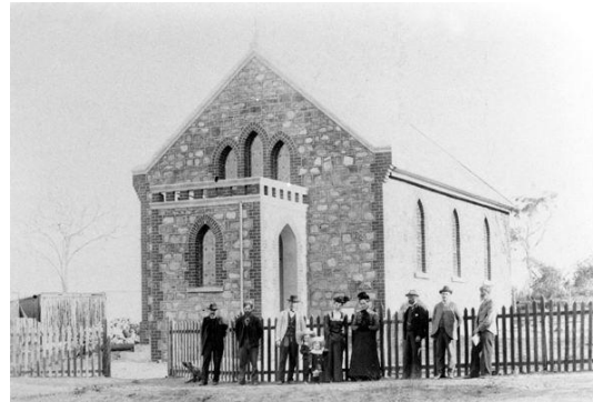
Cuballing Hall (HCWA Pic2103); Baptist Church, Fortune Street, Narrogin (SLWA 012618D)