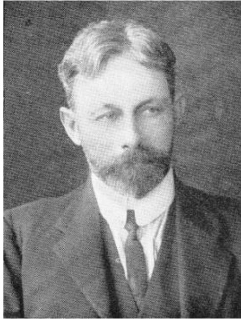
Bertram Heriot Dods

(Battye, J.S., Cyclopedia of Western Australia , Vol.2, 1913, p.709)