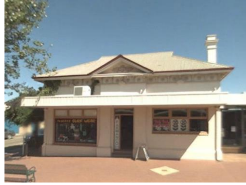
Cornwall Hotel, Doney St, Narrogin; Cornwall's Buildings, Egerton St, Narrogin (SLWA 023743PD; Google 2011)