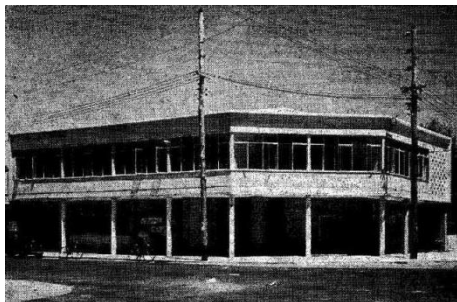
Payton's building, at the corner of Spencer and Stirling-streets, has brought a modern touch to Bunbury's commercial structures.

Colin Mort's sketch view of proposed offices and shops at the corner of Spencer and Stirling Streets Bunbury ( South Western Times , 21 August 1952, p.8).