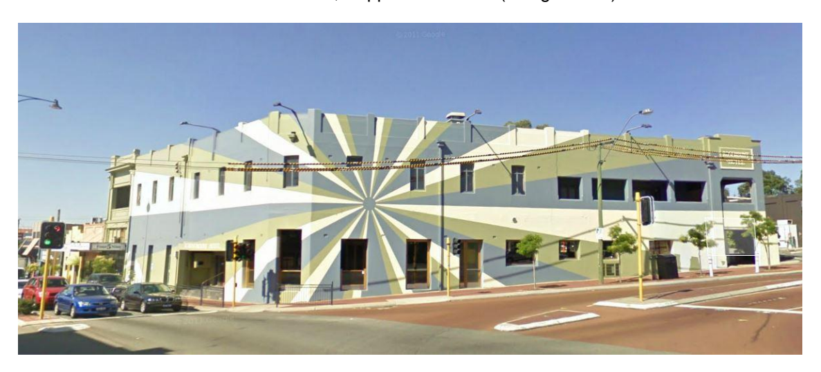
The wrap-around verandahs have been removed and various additions made to the 1902-built Rosemount Hotel, cnr Fitzgerald and Angove Streets North Perth.