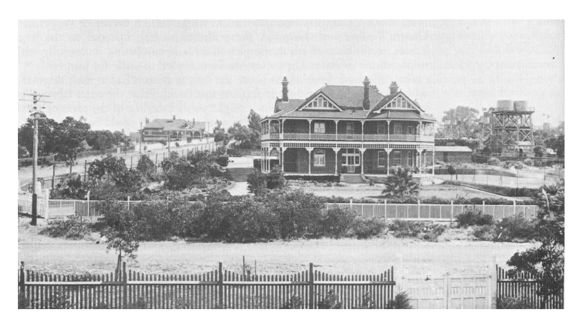
Unalla, north-east cnr View and Forrest Streets, Peppermint Grove (Pascoe p.50).