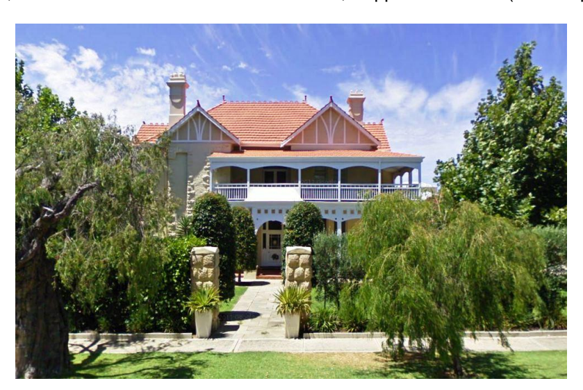
58 Leake Street, Peppermint Grove (Google 2012)