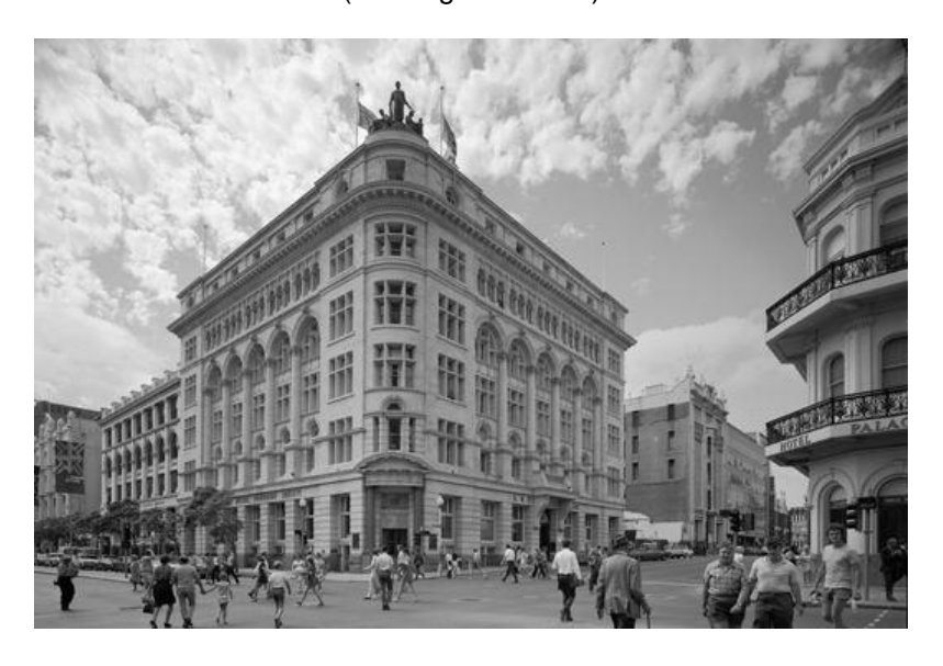
AMP Building, cnr St George's Terrace & William Street, Perth, shortly before its demolition in 1972