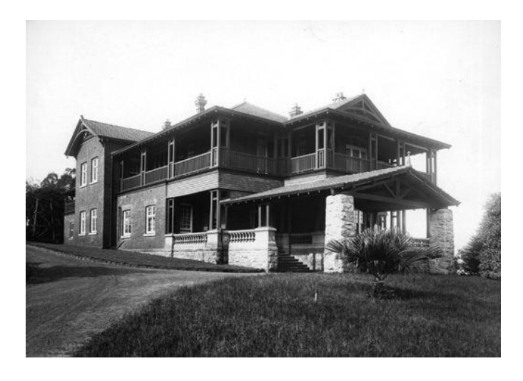
Killowen, Mount Lawley (SLWA 006783D)