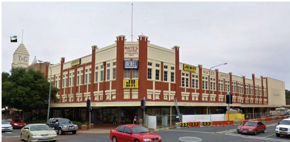
T.H. Mate & Co premises, cnr Dean and Kiewa Streets, Albury