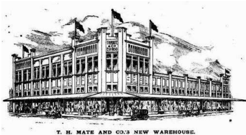
T.H. Mate & Co premises, Albury