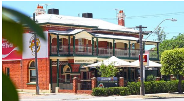
Woodbridge Hotel at 50 East Street, Guildford in 1902 and 2013 ( Western Mail , 25 December 1902, p.88; www.woodbridgehotel.com.au )