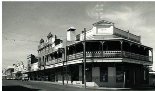
Davies Buildings cnr Avon Terrace and South Street York 1908