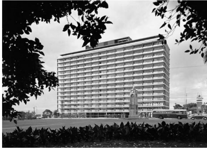
1965 the nearly finished WA Government offices