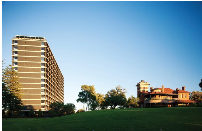
Dumas House with former Observatory at right