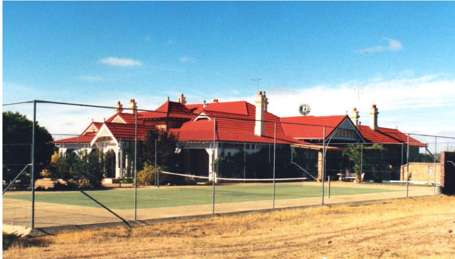
Hardie Family homestead Wallinar, Broomehill built in 1911.