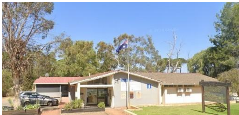
1961 Dandaragan Shire Office & Chambers