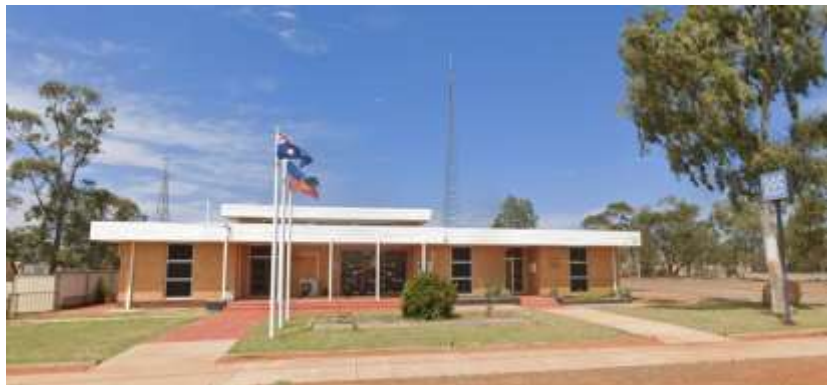
Morowa Police Station, 2 Stokes Road Morawa

1967 Morowa Police Station and Court House HCWA place number 10150.