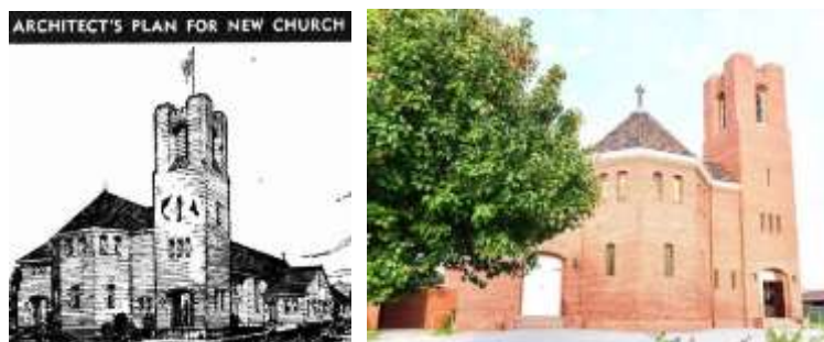
Sketch of St Edmund's Church at Pangbourne Street, Wembley ( The West Australian , 26 June 1954, p.20), and as-built view ( https://www.stedmunds.org.au/history )

Bob Blatchford acted as supervising architect for two projects in WA designed by Melbourne ecclesiastical architect Louis Reginald Williams (1890–1980). The first was St Edmund's Church at Pangbourne Street, Wembley. It was built at a cost, including furniture, of £40 000, and consecrated by Archbishop Moline in 1956. The impressive St Boniface Anglican Cathedral at Parkfield Street Bunbury, was built from 1961.