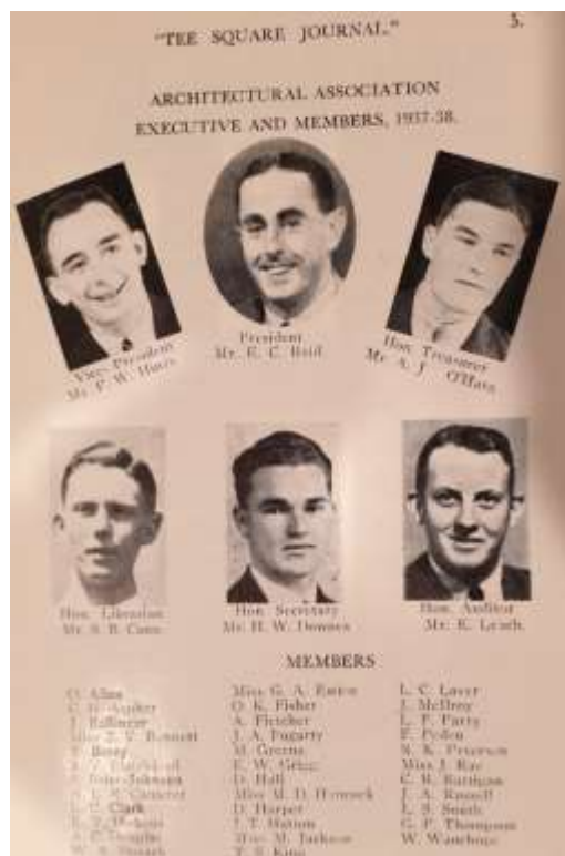
Architectural Association Executive and Members 1937-38 ( Tee Square Journal , 1937, p.5)