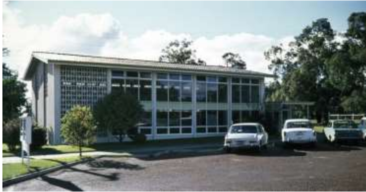
Kalamunda Public Library of 1963, pictured c.1969.

Bob designed a new library for the Shire of Kalamunda, a tender was accepted for its construction in 1962, and it was opened in April 1963 by Charles Court. The plan became a suggested model for other libraries, and was published within 'Siting and design of public library buildings' by the Library Board of Western Australia in 1962.