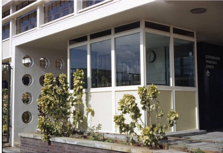
Entrance to Government Printing Office (1952), Station St Subiaco in 1965