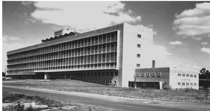
Perth Chest Hospital pictured in 1958

Post-war work at the PWD saw Stan elevated to a number of senior positions, and his projects included the Perth Chest Hospital (which became a portion of Sir Charles Gairdner Hospital), the new Government Printing Office at Subiaco, as well as the extensive remodelling of Government House, the old Arbitration Court Building, and the Treasury and Titles Office. His work on the accommodation and office buildings for the Ord River Scheme in Kununurra was highly regarded as being the first project of its kind to function effectively in a tropical area.