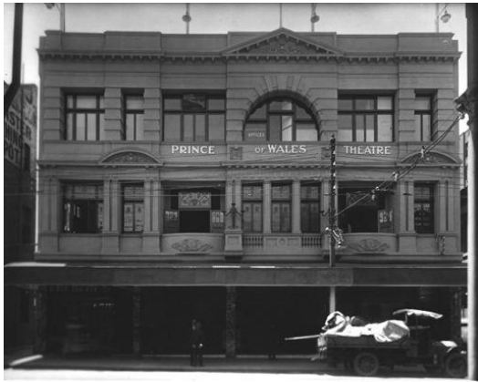
Prince of Wales Theatre, Murray St Perth