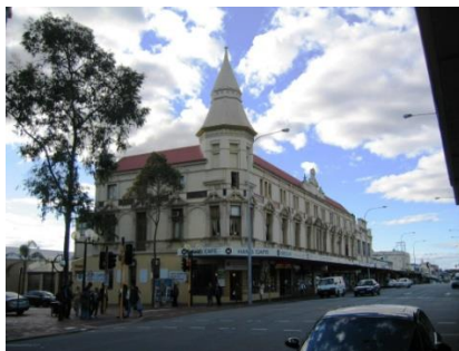
3 rd floor etc, Britannia Hotel William St, Northbridge