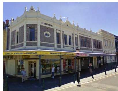
Empire Buildings Stirling Tce cnr York St, Albany

Anthoiness had a consistent number of developments in the Perth metropolitan area, with differing building types such as offices, shops, residences, warehouses, and factories. He completed projects for the Methodist Church at Bagot Road, Subiaco and Ventnor Avenue, West Perth in 1906-1907. Further examples of his versatility include a cold-storage works at West Perth, seven residences at Palmerston and Newcastle Streets, Perth, and a shops-residential building at the corner of Hay and Outram Streets in West Perth, all in 1907.