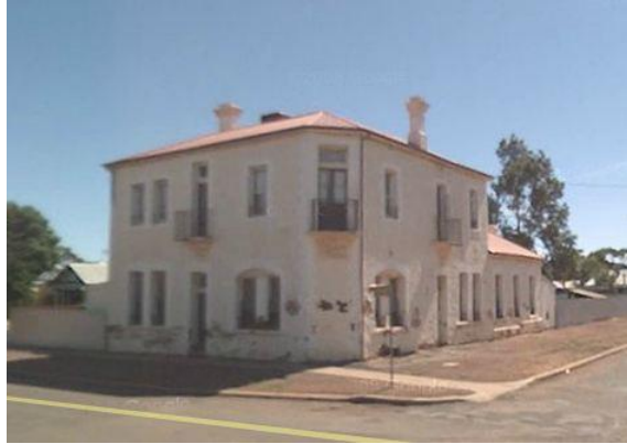
Duke of York Hotel, Burt St Boulder demolished in 2011