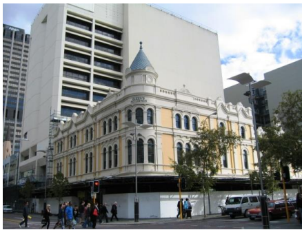
3 rd floor etc, Queen's Buildings, cnr William & Murray Sts Perth