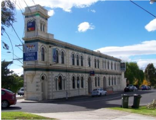
Tower Hotel, Heidelberg Road, Alphington ( http://www.panoramio.com/photo/46753405 )