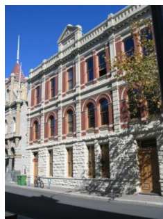
His Majesty's Hotel Mouat St, Fremantle