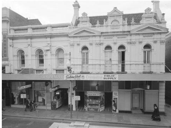
Cremorne Chambers, 572-578 Hay St Perth