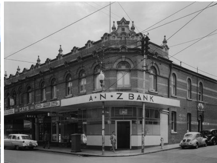
Monash House, cnr Hay & King Sts Perth