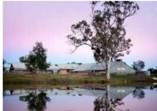
St Patrick's Cathedral Toowoomba (Wikipedia); Jondaryan Woolshed ( www.queensland.com/ )