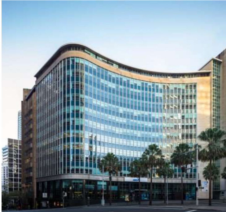
Qantas House, designed by Rudder Littlemore & Rudder and built in 1950 at 1 Chifley Square Sydney