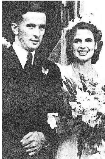
1948 wedding